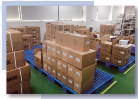
Warehouse at our factory in Jiaxing, PRC

Large amount of packaging materials are used in the Group’s products. To reduce waste generation, the Group strives to reuse all paper boxes and filling materials in packages.